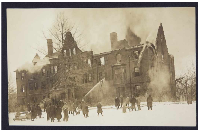
Rockefeller with fire hose and ladder

On the morning of Thursday, December 21, 1922, one day before the fifth anniversary of the Williston fire, another disaster struck the campus. Fire broke out in Rockefeller Hall about 8:30 in the morning and spread so rapidly that it was out of control an hour later. Fire departments had come from South Hadley and Holyoke to join the college’s firemen but they were hampered by low water pressure. By evening only the skeleton of the building remained.