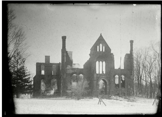
Williston Hall's ruins, 1917