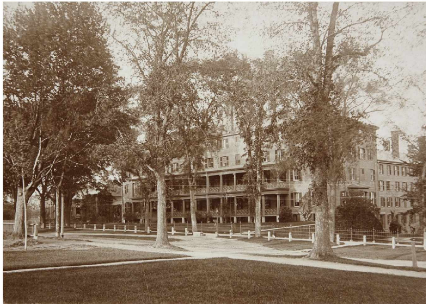
Seminary Hall, c. 1890

and south, and a “piazza” along the street. Then in 1865 north and south wings were joined by the new gymnasium to form an enclosed quadrangle; the power plant was attached on the east side. Five years later the library was added to the north, connected by a sizeable corridor to honor Mary Lyon’s utopian conception of a community with all its functions under one roof. The gigantic building dominated the village, contrasting with the nearby frame houses. Indeed, the institution’s activities were central to the town’s culture and its economy. In 1888 the seminary, its curriculum expanded, was elevated to Mount Holyoke Seminary and College; it was chartered finally as Mount Holyoke College in 1893.