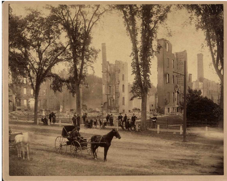
Seminary Hall ruins, September 28, 1896 (H.W. Macy)

South Hadley residents began clustering on College Street in early evening to view the fire. The electric trolley from Holyoke brought about 3000 onlookers, the biggest crowd the village had ever known. (The trolley line added special cars to accommodate the spectators.) With amazing proficiency college people had scurried about among the friendly onlookers and made a list of those who volunteered to house students who then numbered 339. The college placed some of them in three frame houses it owned and in the local hotel, but that left a goodly number who had to be put up in private homes. The college paid homeowners $5 a week for board and room. The faculty and staff also had to find places to stay. Most students lost their winter clothes which had been in the attic, but other college and student goods were taken to the Rockefeller skating rink only built the spring before.