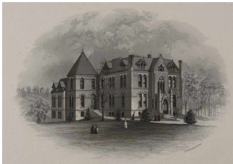
Williston Hall, 1889 (J.D. Daniels)

Mount Holyoke's second great conflagration erupted on December 22, 1917, when Williston Hall was destroyed by fire. It housed botany, zoology, physiology and geology, so the loss of classrooms, laboratories, collections and departmental libraries left a huge hole. It was also a cavernous void in the college's landscape and in its social life. Constructed in 1876, it had been the first autonomous academic building beyond Seminary Hall. Dedicated to the natural sciences and art, it soon became crowded and so a substantial wing, the Annex, had been added in 1889. In 1892 physics and chemistry moved from Williston to the new Shattuck Hall, allowing art and the other sciences to expand into the vacated quarters.