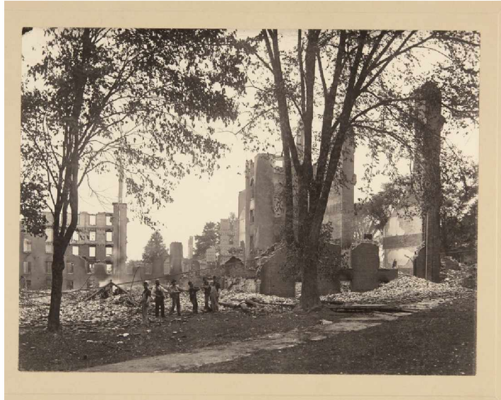
September 18, 1906, 6 men in the ruins

of the onlookers knowingly posed for his camera whose lens and film required a short pause. Probably Macy asked the two men in the buggy to hold their poses although their white horse wasn't so cooperative and moved its head. Here and there in the ruins smoke is still rising. Trolley tracks can be found through the glaring light reflections of the street.