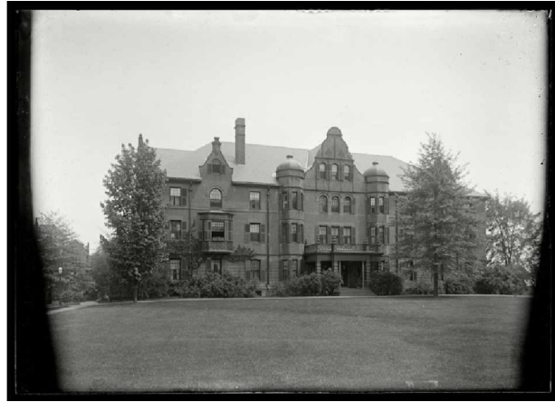
Old Rockefeller Hall, c. 1910 (Asa Kinney)

On the morning of Thursday, December 21, 1922, one day before the fifth anniversary of the Williston fire, another disaster struck the campus. Fire broke out in Rockefeller Hall about 8:30 in the morning and spread so rapidly that it was out of control an hour later. Fire departments had come from South Hadley and Holyoke to join the college’s firemen but they were hampered by low water pressure. By evening only the skeleton of the building remained.