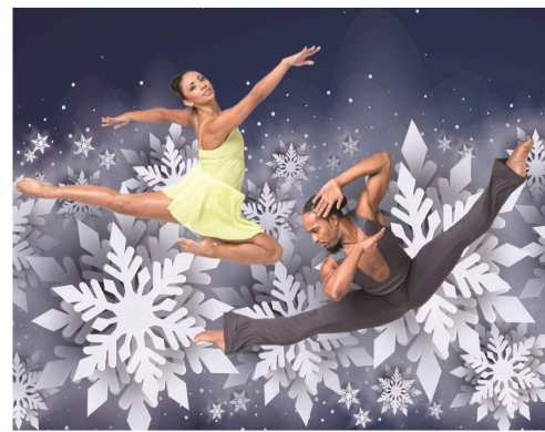
Philadanco.