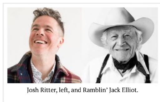
Josh Ritter, left, and Ramblin’ Jack Elliot.