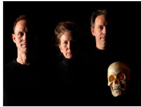
A Skull in Connemara.