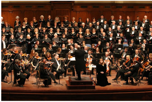
Springfield Symphony Orchestra

those tunes — a number from the 19th-century opera Carmen , Mose Allison’s “Was,” and “Elderly Woman in a Small Cafe” by Pearl Jam — was especially notable.