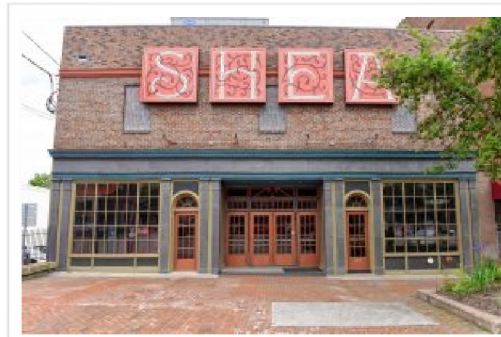
The Shea Theater on Ave A in Turners Falls in 2017.