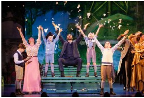
Finding Neverland.

Peter Pan is one of the most enduring characters in children’s literature. He first appeared in 1902 in an adult novel by British writer J.M. Barrie, and a few years later Barrie made Peter the center of a play about a boy who wouldn’t grow up, then developed the character further in his 1911 novel, Peter and Wendy . Since then, Peter has been the focus of myriad stage, film, and TV productions — probably too many to count. So it was refreshing to see a new treatment of the subject arrive in 1998 in the form of