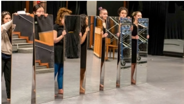
Some of the 15 student performers rehearse Joan Jonas '58's "Mirror Piece I & II: Reconfigured (1969/2018-2019)" under the guidance of the artist.

( https://web.archive.org/web/20190327032326/https://www.mtholyoke.edu/sites/default/files/media/images/Joan%20Jonas_student%20performance_HL1.jpg )