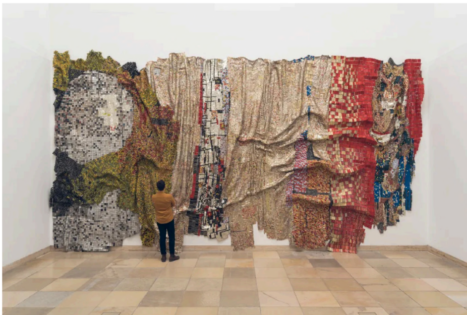
"In the World But Don't Know the World" (2019) by El Anatsui

On View presents images from noteworthy exhibitions