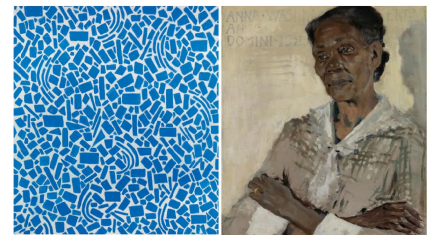
SOLD AT PHILLIPS AUCTION: UNTITLED STUDY BY ALMA THOMAS FEATURED ON COVER OF MAJOR EXHIBITION CATALOG