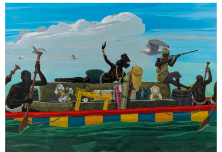
A YEAR OF AFRICAN AMERICAN ART: NEW 2026 WALL CALENDARS FEATURE WORKS BY FAITH RINGGOLD, ALMA THOMAS, AND MANY OTHERS