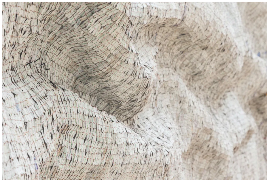
EL ANATSUI, Detail of "Rising Sea," 2019 (aluminum and copper wire).

FROM THE ARCHIVES: BEGINNING IN LATE 1950S, AFRICAN AMERICAN PAINTERS KNOWN AS 'HIGHWAYMEN' CAPTURED FLORIDA'S NATURAL LANDSCAPES