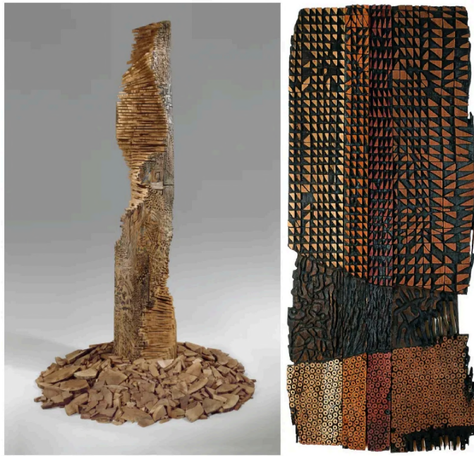
From left, EL ANATSUI, "Erosion," 1992 (wood). | Collection of the Smithsonian National Museum of African Art, Washington D.C.; and EL ANATSUI, "Leopard Cloth," 1993 (wood Relief, Mansonia, Camwood Opepe & Oyili-oji, 63.8 x 27.2 x 1.3 inches / 162 x 69 x 3 cm). | Agnes and Andrew Usill Collection, London

AMERICAN ARTIST LIVED IS NOW NAMED IN HER HONOR