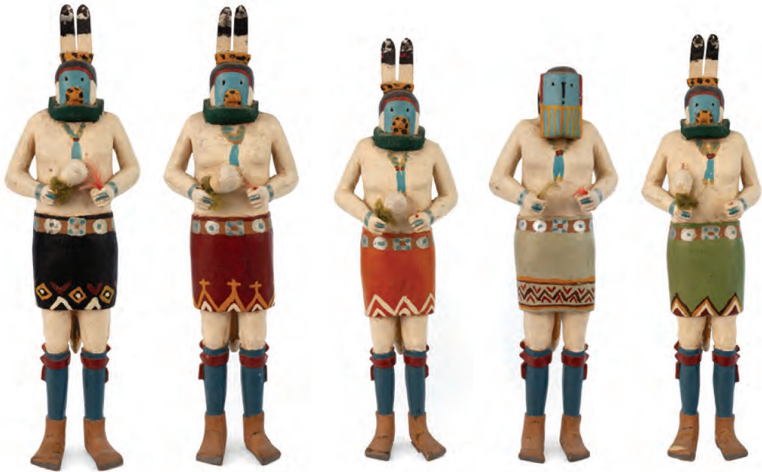
Above: Unknown Diné (Navajo) maker, Multi-Figural Yeibichai Dancers with Two Yei Heads , 1920s