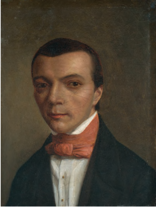
Above left: Unknown American maker, Portrait of a Young Gentleman, Thought to Be a New Orleans Free Man of Color , ca. 1830–1850