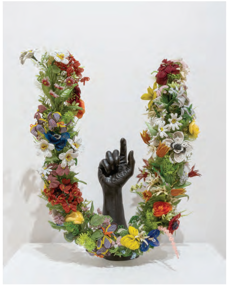
Above right: Nick Cave (American, b. 1959), Unarmed , 2022