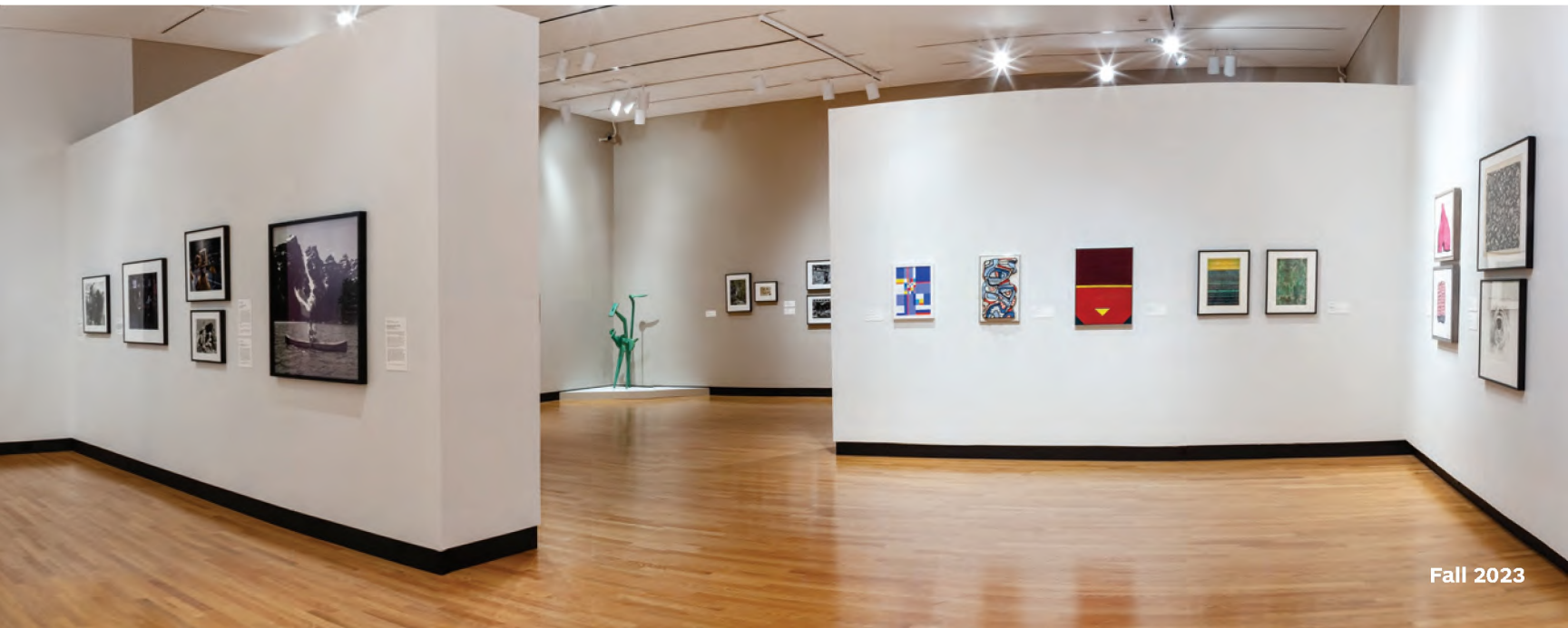
Opposite below: Installation view of former gallery of Asian art