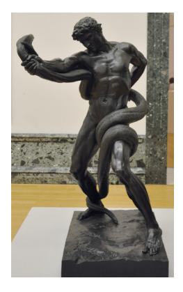
Frederic Leighton (British, 1830–1896), An Athlete Wrestling with a Python, 1877, bronze, Tate Britain, London