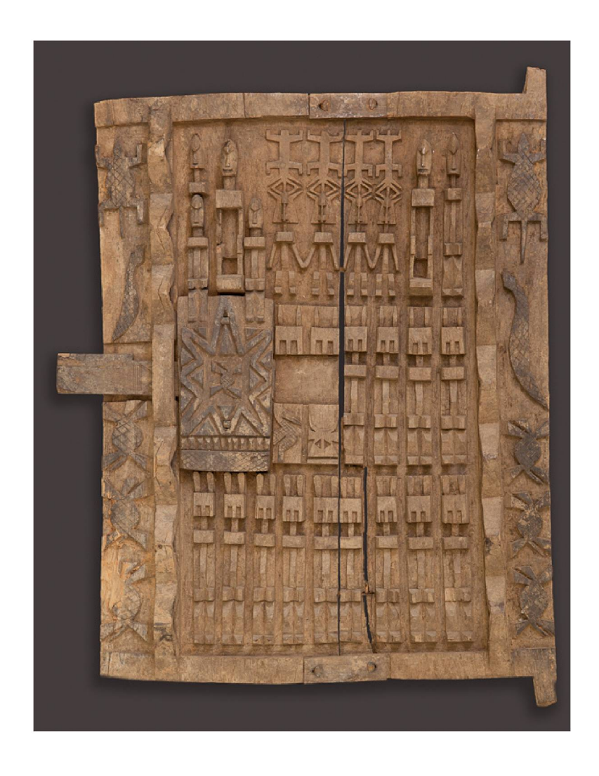
Unidentified Dogon artist (from the Bandiagara Escarpment, Mali) Granary Door, first half of the 20th century On loan from Eugenia and Robert L. Herbert

These doors were used to cover the small, window-like openings of grain-storage buildings. This particular door is from the Dogon people in West Africa, south of the Niger bend. Carved into the wood are patterns and depictions of ancestors and sacred animals to protect the harvest. The detailed facade is made up of two panels held together by iron staples and accented with a simple sliding lock mechanism. In Rawlins-Jackson's quilt, we can see the influence of the Granary door's structure with the intricate cathedral window, wood-like border, and use of symbolic animals and cowrie shells. This was her way of mimicking the Granary door's sacred figure carvings. I wanted to have these two pieces side by side to highlight both the textural differences and similar embellishments. Rawlins-Jackson also speaks to the fact that this quilt is capturing a memory of her ancestors just like the Granary door.