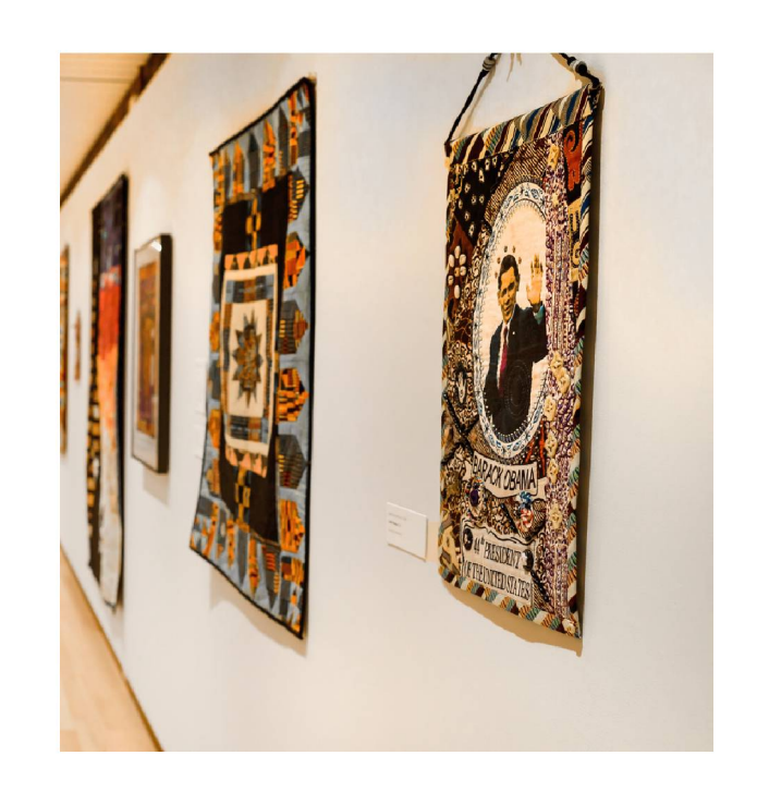
Sheila Lutz (American, b. 1953) 44th President, 2017 On loan from the artist

The three design blocks depicted in this quilt have connections to the Underground Railroad. The block at the top —the 8-point north star—is also featured at the top right corner of The Laundress quilt. The design carries two messages—one: prepare to escape, and two: follow the North Star to freedom in Canada. North was the direction of traffic on the Underground Railroad and this signal was often used in conjunction with the song "Follow the Drinking Gourd," a reference to the Big Dipper constellation which points towards the North Star. The next square holds the "bow tie signal" which was a sign for slaves to dress and travel in their best so that they might be seen as free men and women. The last pattern is called "flying geese" and was used as a signal for slaves to follow the direction of geese as they migrated north in the spring.