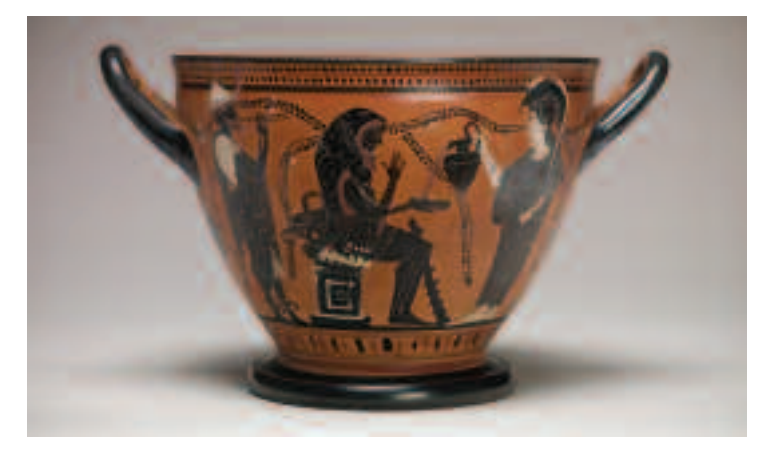
Theseus Painter (Greek, active ca. 500 BCE) Black figure skyphos with Herakles, Athena, and Hermes Terracotta, ca. 500 BCE Purchase with the Nancy Everett Dwight Fund