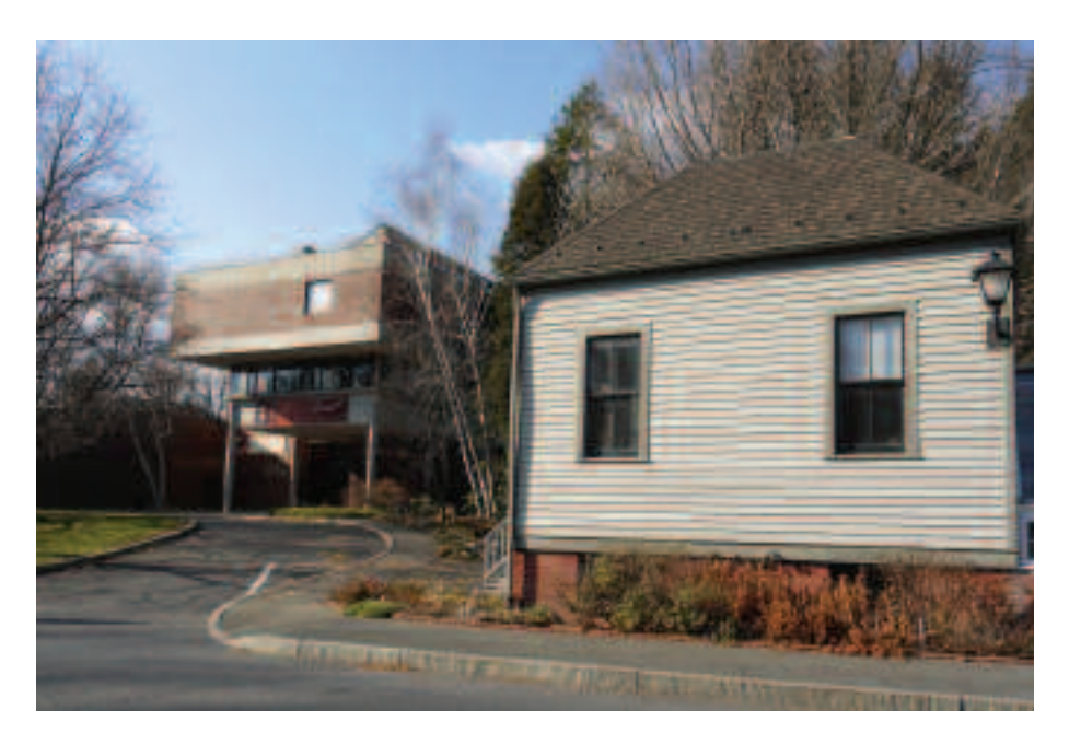
The former home of the Miller Worley Center for the Environment (right) has now become the new Art Museum Annex, housing offices for staff.

The Leading Women in the Arts series, launched by the Weissmann Center in spring 2006, is produced in collaboration with the InterArts Council, which represents the departments of art and art history, creative writing, dance, film studies, music, theater, and the Art Museum. This engaging program sponsors public presentations by scholars, artists, writers, and practitioners that connect the academic work of the College with the arts in the public sphere. Invited guest artists are featured in public campus discussions about the interconnections between creative expressions of all forms.