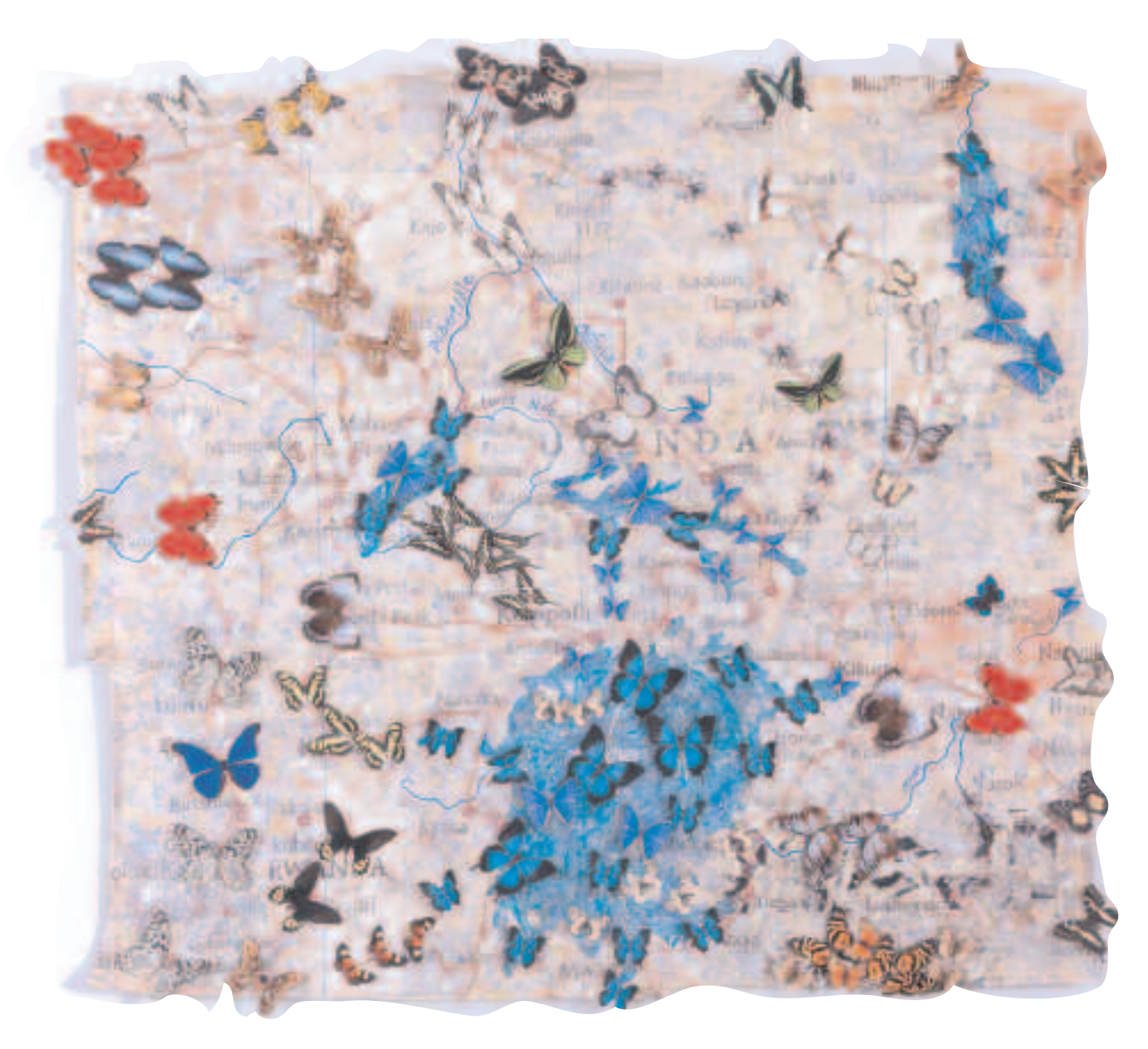
Jane Hammond (American, b. 1950) All Souls (Masindi), gouache, acrylic paint, graphite, colored pencil, archival digital prints, metal leaf, false eyelashes, and horsehair on assorted handmade papers, 2006 Collection of the artist © 2006 Jane Hammond

drawing. But it is something about this increased bodilessness and this ability to hold different kinds of information that attracts me.