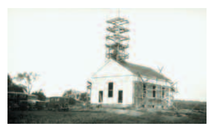
Les Campbell (American, b. 1925) Quabbin Pearls, high-resolution scan from a 35mm Ektachrome transparency, printed with LightJet on archival photographic paper, 1983

Joseph Allen Skinner Museum of Mount Holyoke College, South Hadley, Massachusetts (formerly the Congregational Church of the "lost town" of Prescott)