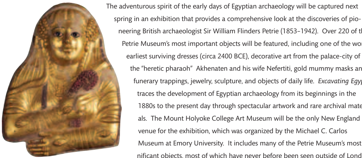
Early Roman Period, Hawara, Mummy mask, cartonnage, gilt, bronze, and glass, 40-60 CE

Excavating Egypt: Great Discoveries from the Petrie Museum of Egyptian Archaeology, University College, London 17 February-22 July 2007