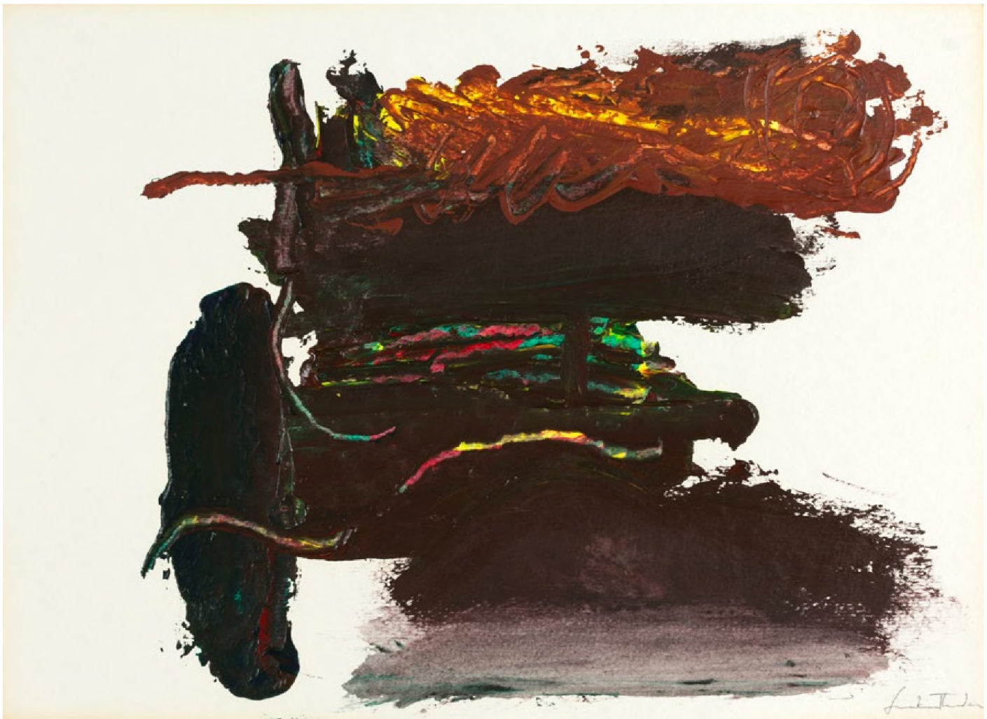
Below: Helen Frankenthaler (American, 1928–2011), Montauk VI , 1985