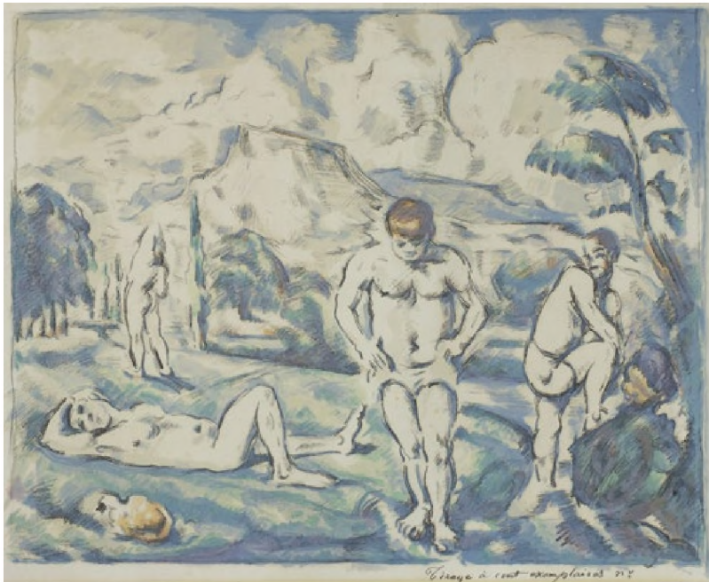
Left: Paul Cézanne (French, 1839–1896), Les Baigneurs (grande planche), 1896/7