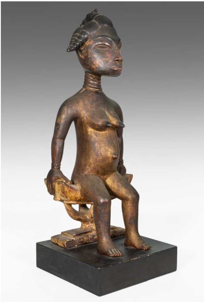
Left: Osei Bonsu (Ashanti, 1900–1977), Queen Mother Figure , late 1920s