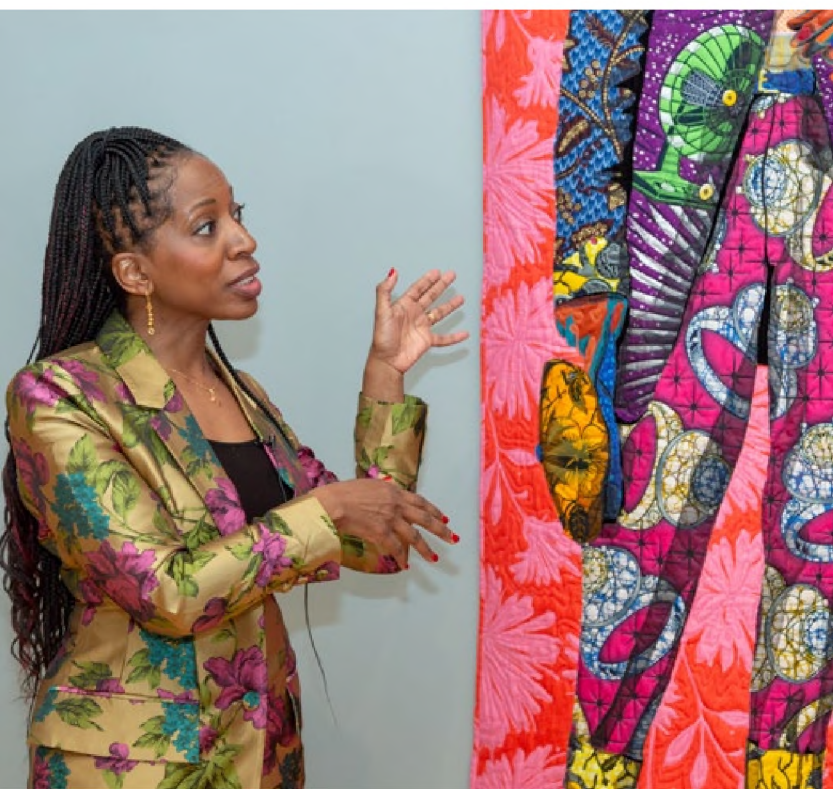
Above: Artist Bisa Butler discussing her work Broom Jumpers , 2019.