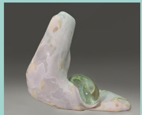
Top: Hector Dionicio Mendoza (American, b. Mexico, 1969), Mariposa/Butterfly , 2017