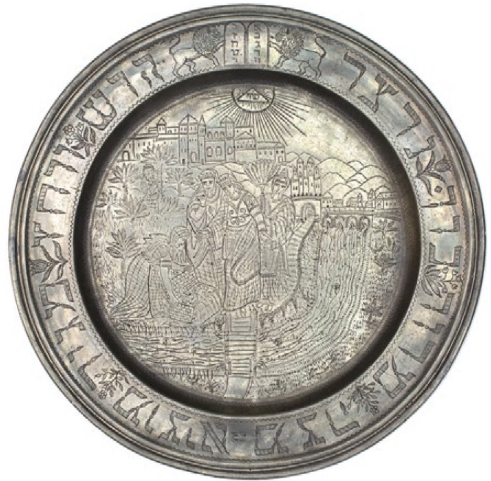
Above: Jacques Frédéric Borst (Alsatian, active 1769–1810), Seder plate , ca. 1802

Early 20th-century Queen Mother figure by Osei Bonsu (Ashanti, 1900–1977), purchased with the Belle and Hy Baier Art Acquisition Fund