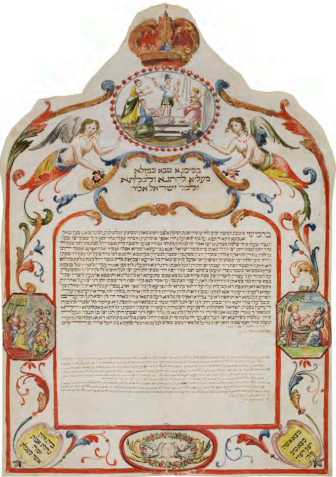
Left: Ketubbah , 1823, Italian Above: Lorna Simpson (American, b. 1960), Cloudscape , 2004 Opposite: Ikeda Koson (Japanese, 1801–1866), [Autumn and Spring] , 19th century