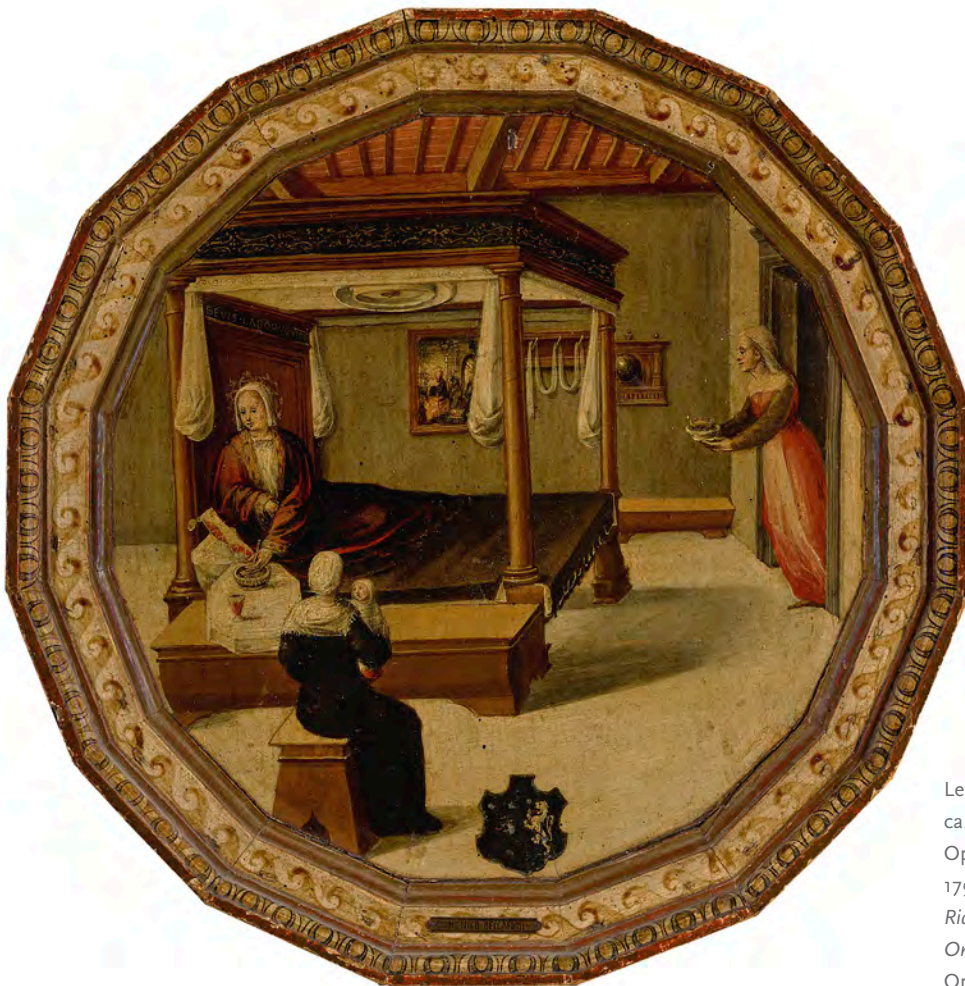
Left: Master of the Chigi-Saracini Desco (Italian, active ca. 1510–1540), Desco da Parto (Birth Tray) , 1520–1540 Opposite above: Utagawa Hiroshige I (Japanese, 1797–1858), Asakusa tanbo Torinomachi mode {Asakusa Ricefield and Torinomachi Festival}; No. 101 from One Hundred Famous Views of Edo , 1857 Opposite below: Ge'ez script Bible , 19th century, Ethiopian