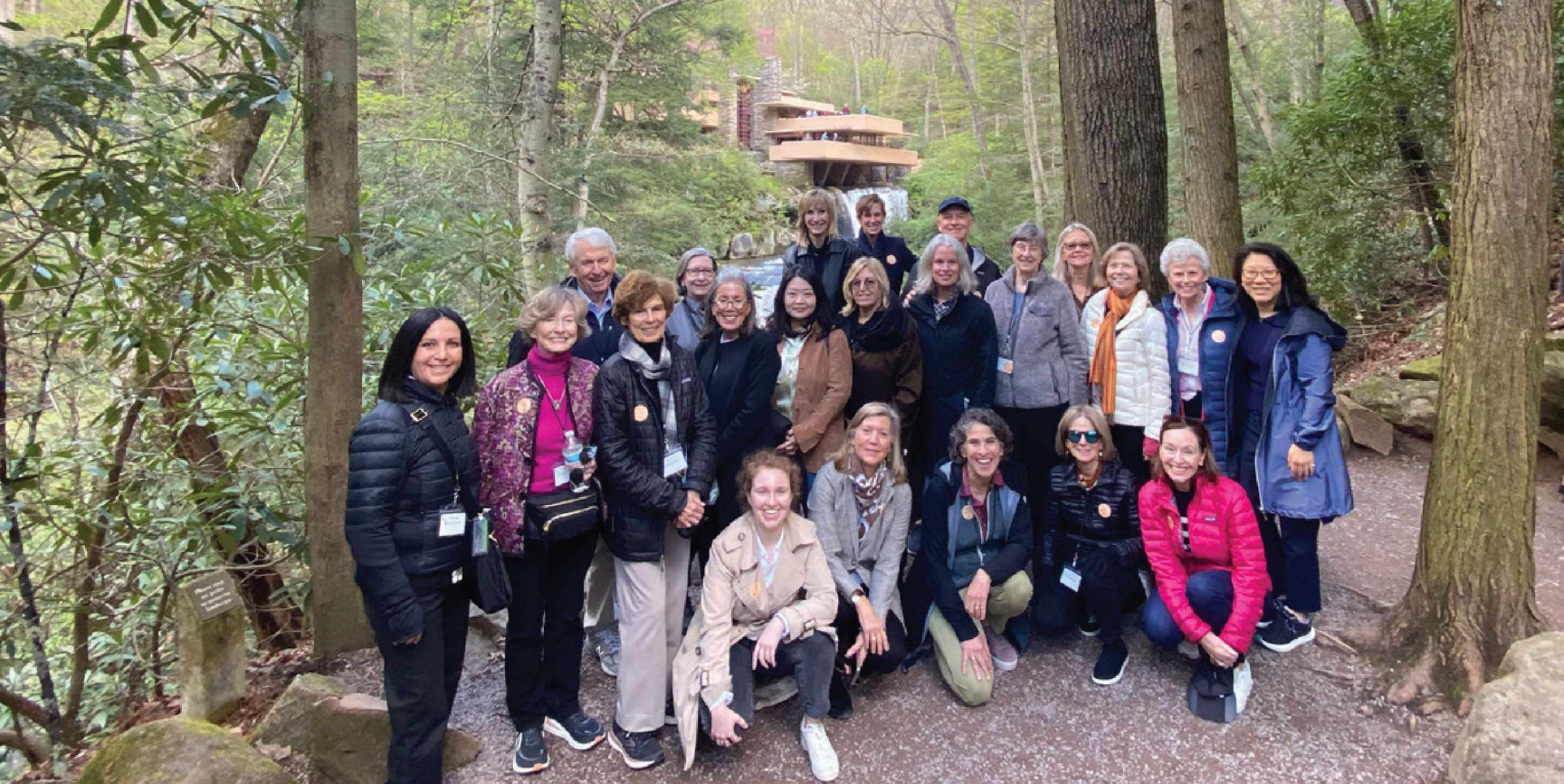
Director's Circle tour participants at Frank Lloyd Wright's Fallingwater, May 2023