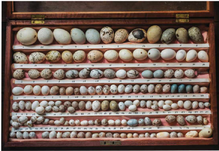
Above: Rosamund Wolff Purcell (American, b. 1942), Egg collection with no annotation , 2013 capture; 2019 print