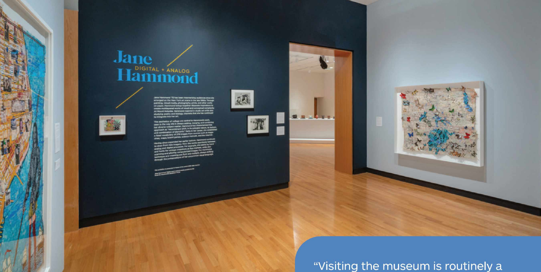
Above: Installation view of Jane Hammond: Digital + Analog , with All Souls (Masindi) , 2006, featured at right