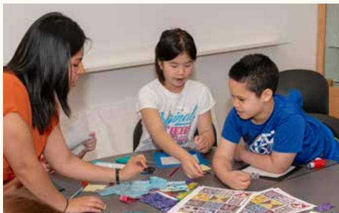
Top images: Fourth graders from Mosier Elementary School create their own Mary Lee Bendolph-inspired quilts. Right: Students from the Springfield Renaissance School collaborate in MHC’s Makerspace.