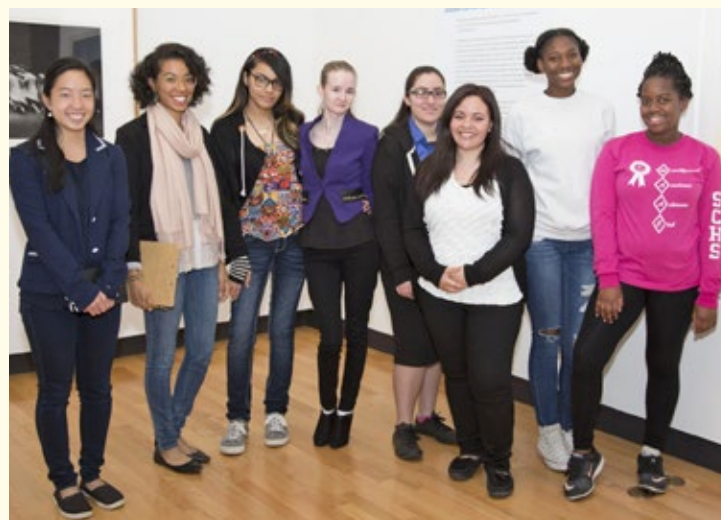
11th and 12th graders from the Springfield Renaissance School complete a 6-month Museum program on Art and Identity.

Highlights of this year's outreach included: a partnership with the Springfield Renaissance School coordinated by two Art and Community Engagement interns; a collaboration with Mount Holyoke's Community-Based Learning department on a series of campus visits for young mothers enrolled in a high school equivalency program at the Care Center of Holyoke; and customized, interactive tours for 280 Mosier School 3rd graders to the Skinner Museum and 4th graders to the Art Museum led by our Summer Education Fellows.