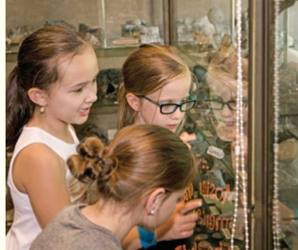
3rd graders explore the Skinner Museum on a class trip.