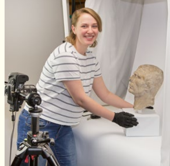
Left: 4th grade students participate in a close-looking session in the Museum's Renee Cary Gallery.